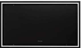
36”W. CEILING HOOD - BLACK MVCEHS636BK