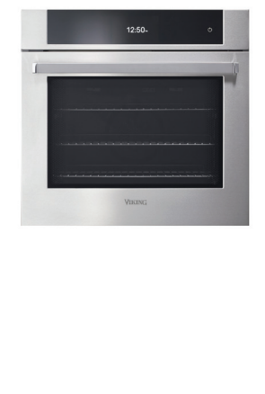
30"W. ELECTRIC SINGLE OVEN MVSOE6301SS