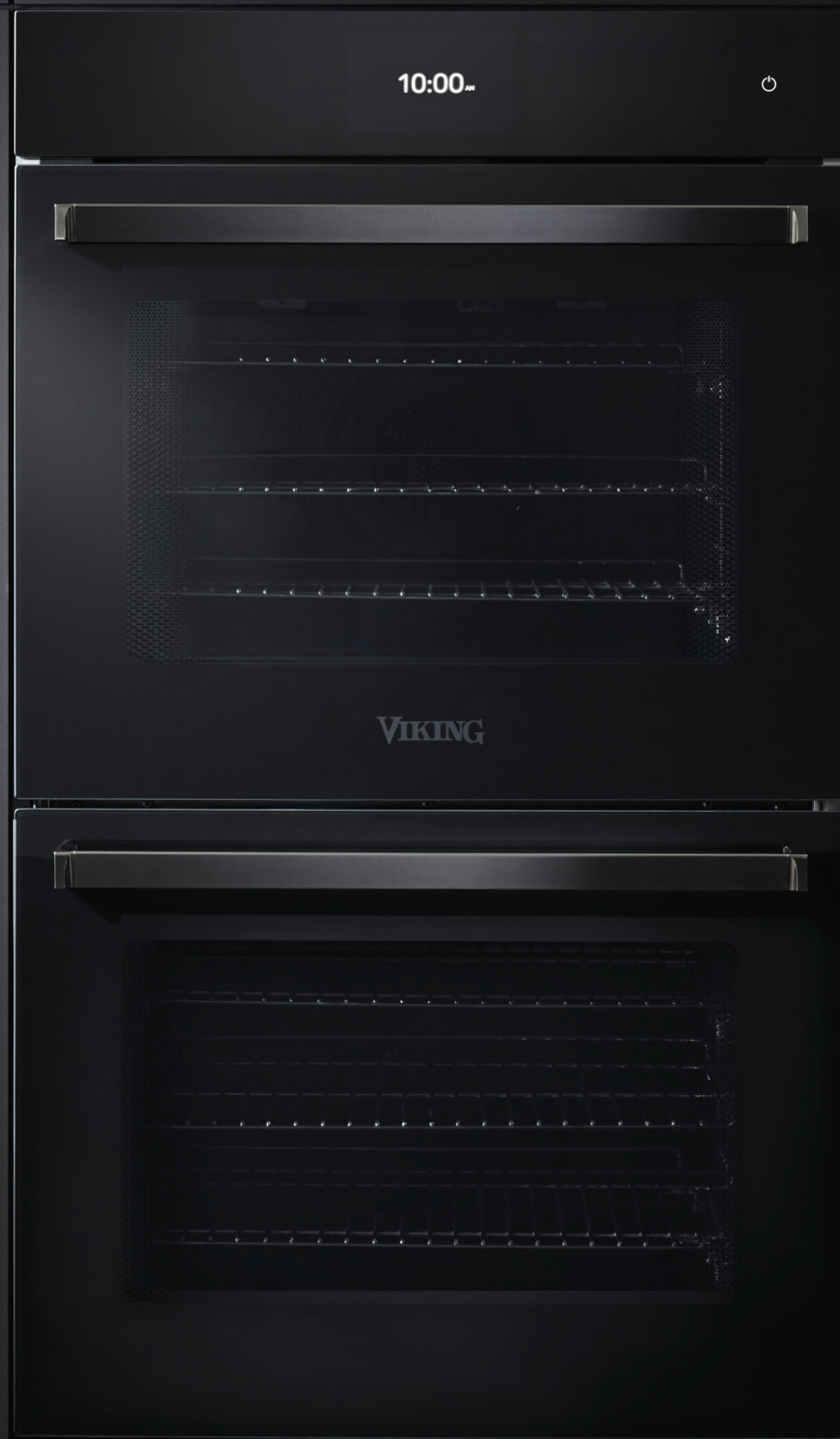
VIKING RVL DOUBLE OVEN IN BLACK GLASS