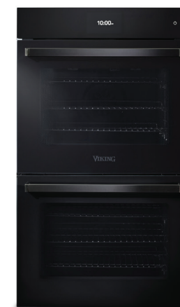
30"W. ELECTRIC DOUBLE OVEN MVDOE6301BG