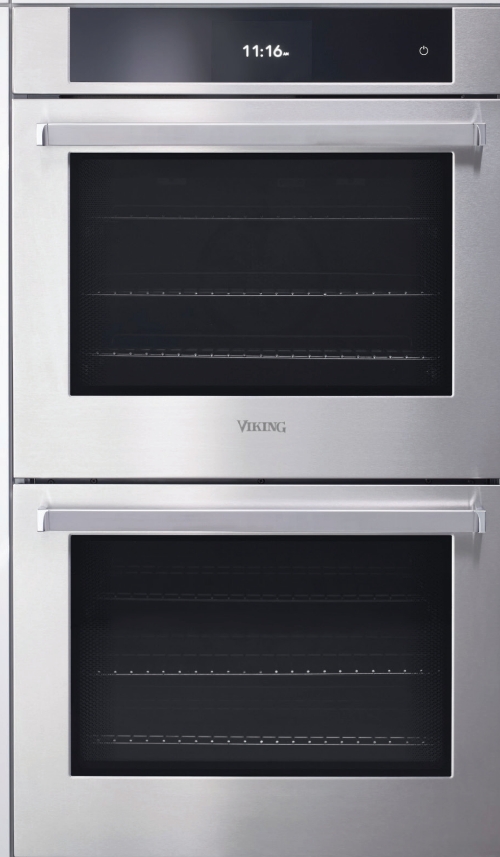
VIKING RVL DOUBLE OVEN IN STAINLESS STEEL