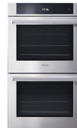
30"W. ELECTRIC DOUBLE OVEN MVDOE6301SS