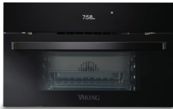
30"W. CONVECT-STEAM OVEN MVSOC6301BG