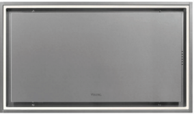
36”W. CEILING HOOD STAINLESS STEEL MVCEHS636SS