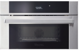
30"W. COMBI-SPEED OVEN MVMSOC6301SS