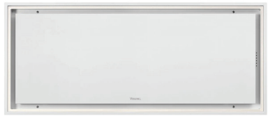
48”W. CEILING HOOD - WHITE MVCEHS648WH