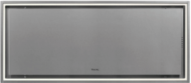
48”W. CEILING HOOD STAINLESS STEEL MVCEHS648SS