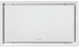
36”W. CEILING HOOD - WHITE MVCEHS636WH