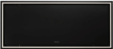
48”W. CEILING HOOD - BLACK MVCEHS648BK