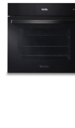
30"W. ELECTRIC SINGLE OVEN MVSOE6301BG