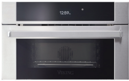
30"W. CONVECT-STEAM OVEN MVSOC6301SS